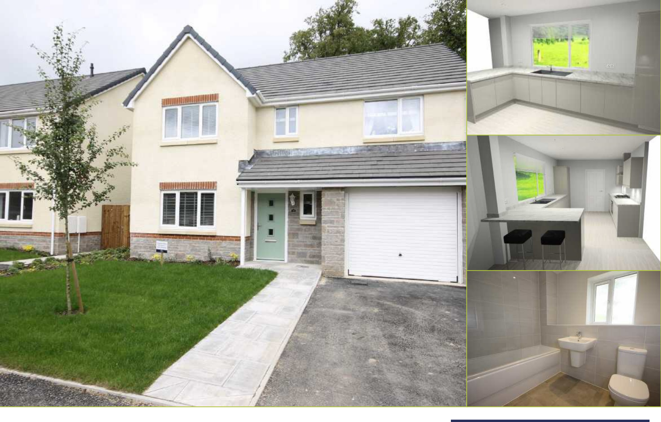
Plot 2 Millers Wood (Beech), Penmaen, NP120EU £335,000