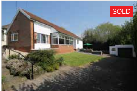
Pontygwindy Road, Caerphilly £299,950