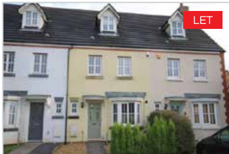
Heol Y Dolau, Pencoed £650 pcm