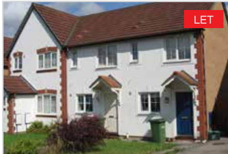
Llys Y Coed, Ystrad Mynach £575 pcm