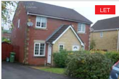
Cwrt Nant Y Felin £650 pcm