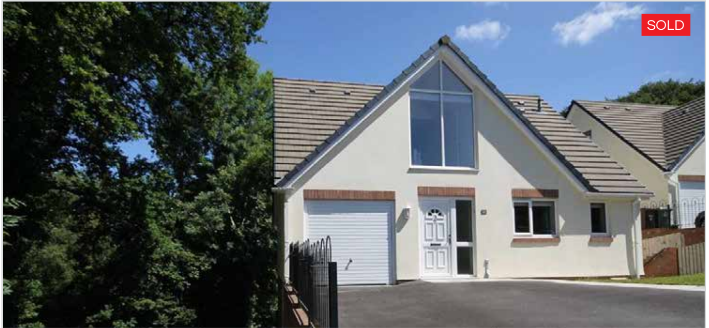
Heol Y Berth, Caerphilly | £389,950