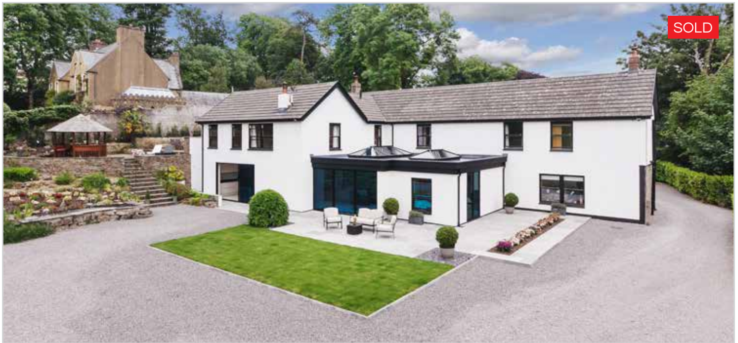
Stone Court, Bonvilston | £1,500,000