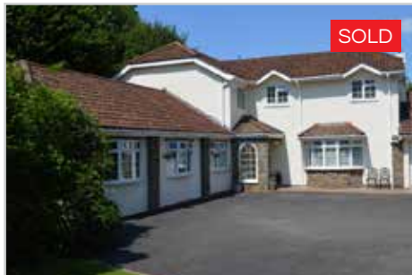
Springfield, Graig Penllyn £549,995