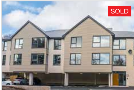
Castle Manor, Caerphilly From £133,950