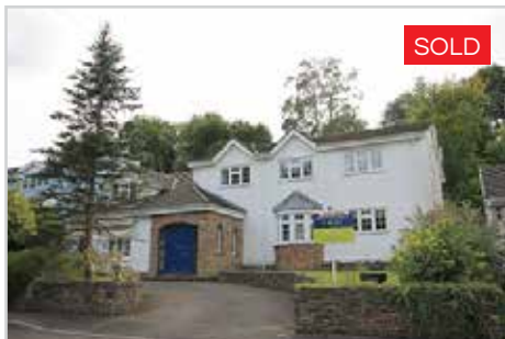
Oakville, Graig Penllyn £499,950