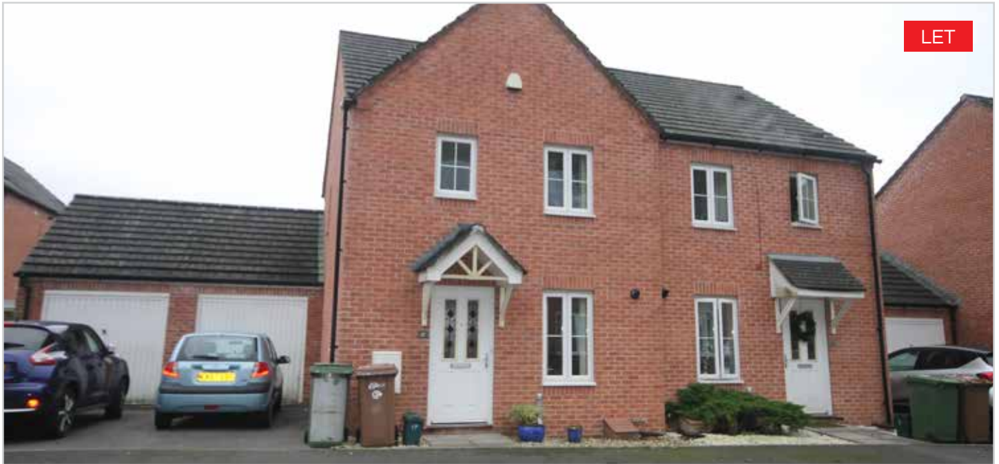
Bluebell View, Llanbradach | £625 pcm