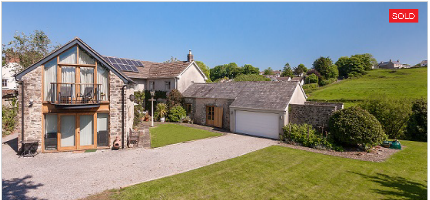
Old Town Mill, Town Mill Road, Cowbridge | £1,350,000