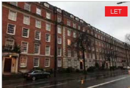
Windsor House, Cardiff £575 pcm