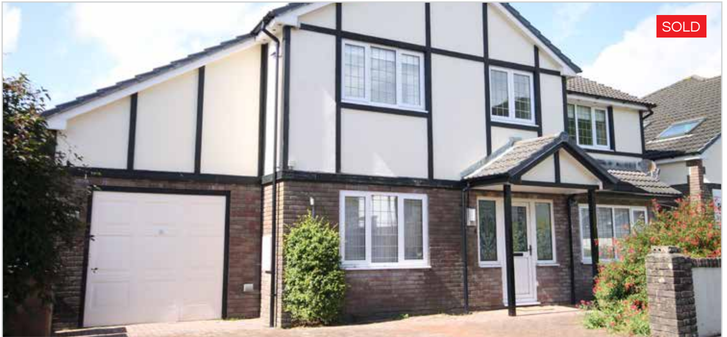
Ffordd Las, Abertridwr | £369,950