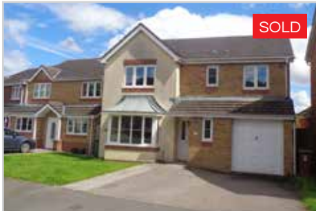
Sword Hill, Caerphilly £265,000