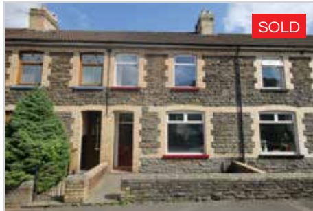
Garden Street, Llanbradach £150,000