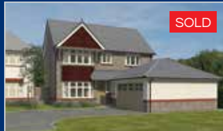
St David's Meadow, Colwinston