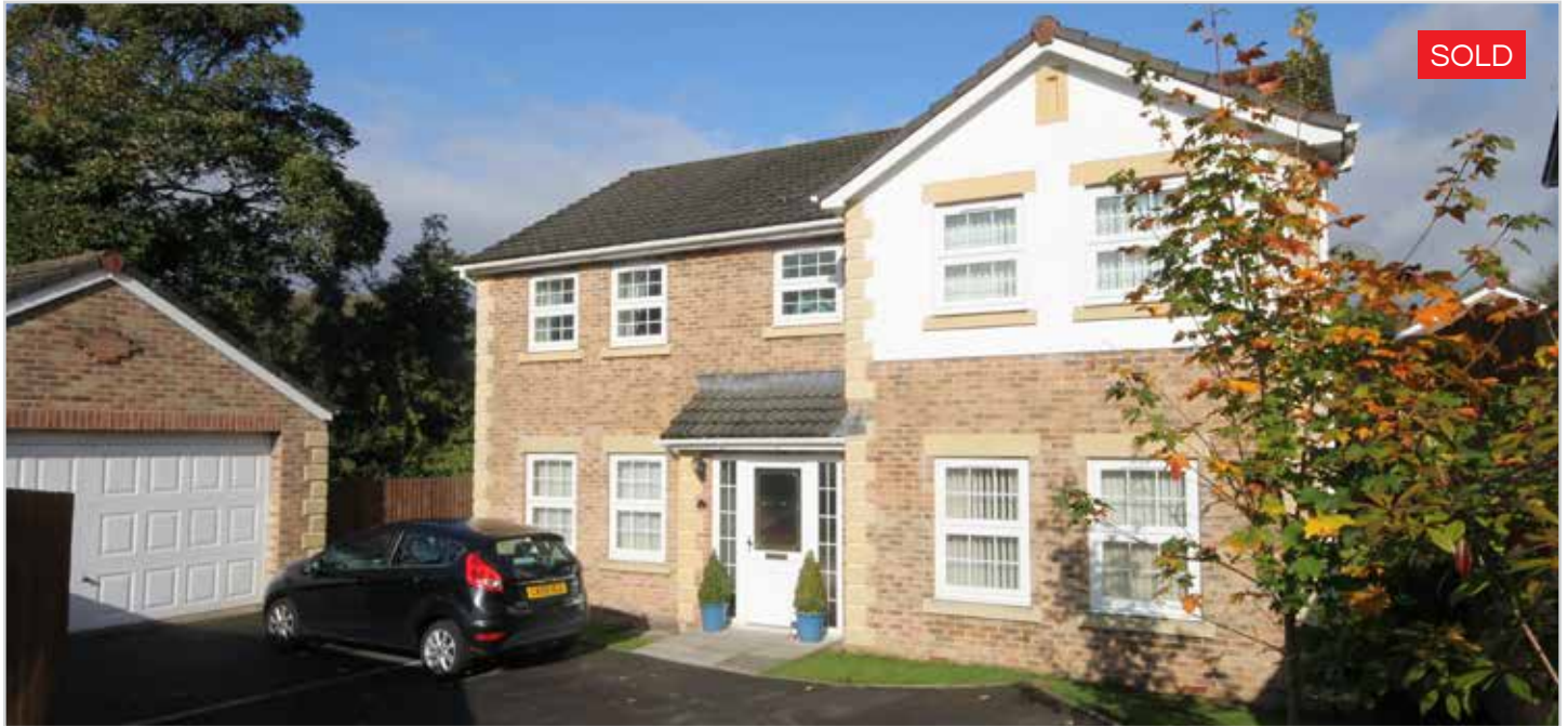
Manor Court, Edwardsville | £300,000