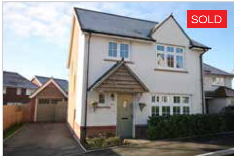
Highfield Rise, Trelewis £235,000