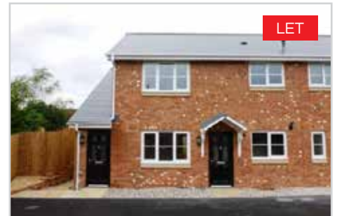
Alynlee Court, Treharris £525 pcm