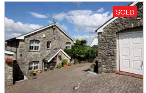
5 Penylan Court, St Brides Major £375,000