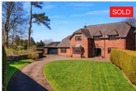
St Anne Lodge, Talygarn £749,450