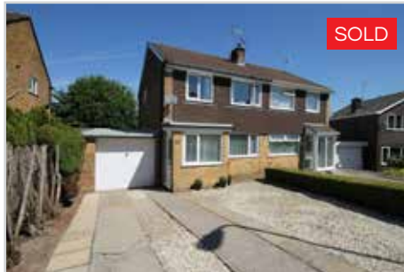
Plas Grug, Caerphilly £199,950