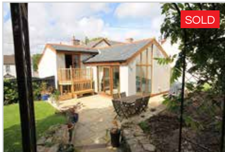
Cross House, Cowbridge Road, Aberthin | £399,950