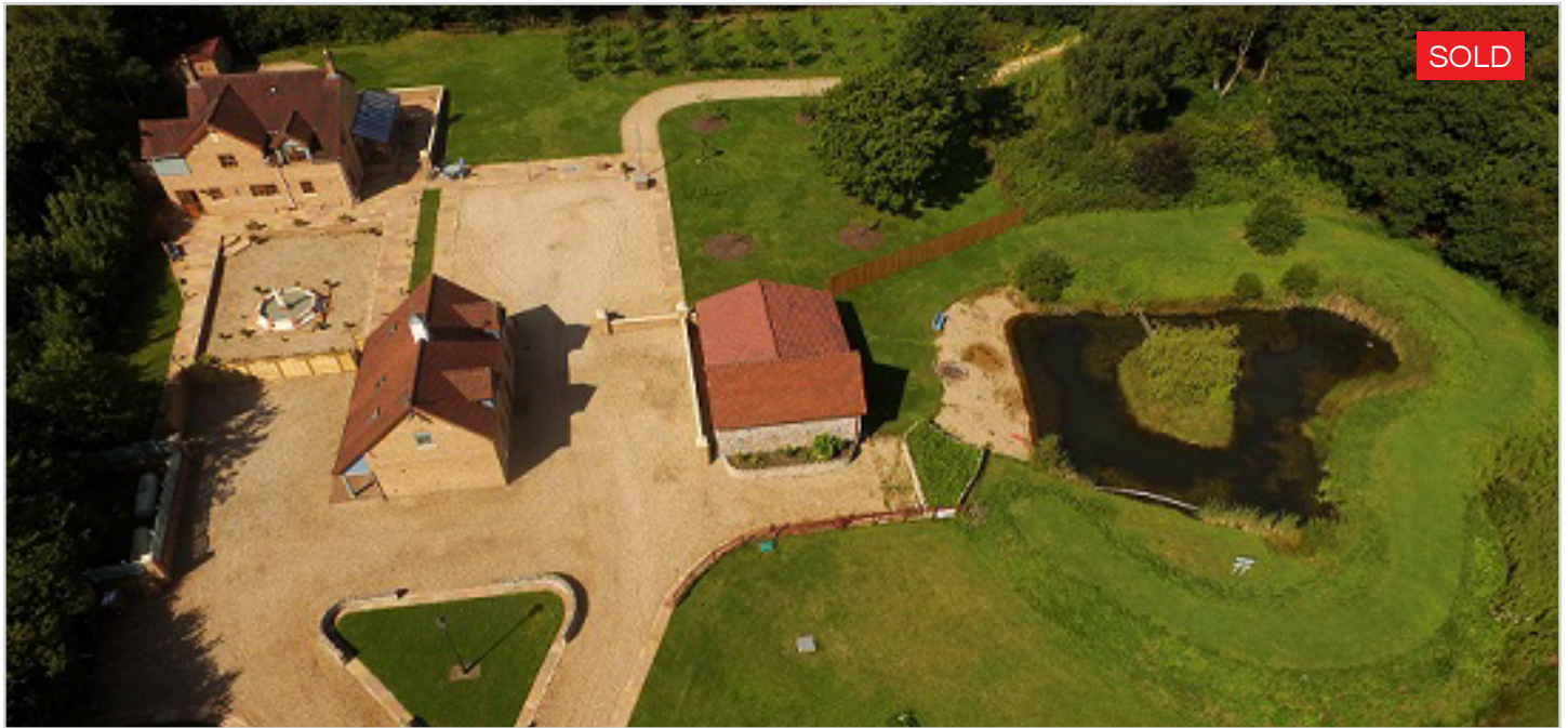
The Meadows, Gypsy Lane, Groesfaen | £1,150,000