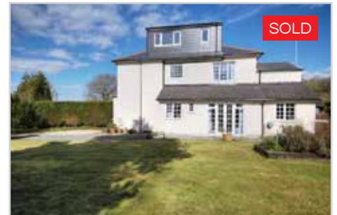
Waterton House, Brocastle £375,000