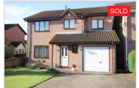
Sunningdale, Caerphilly £315,000