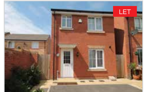
Kingsmead, Caerphilly £850 pcm