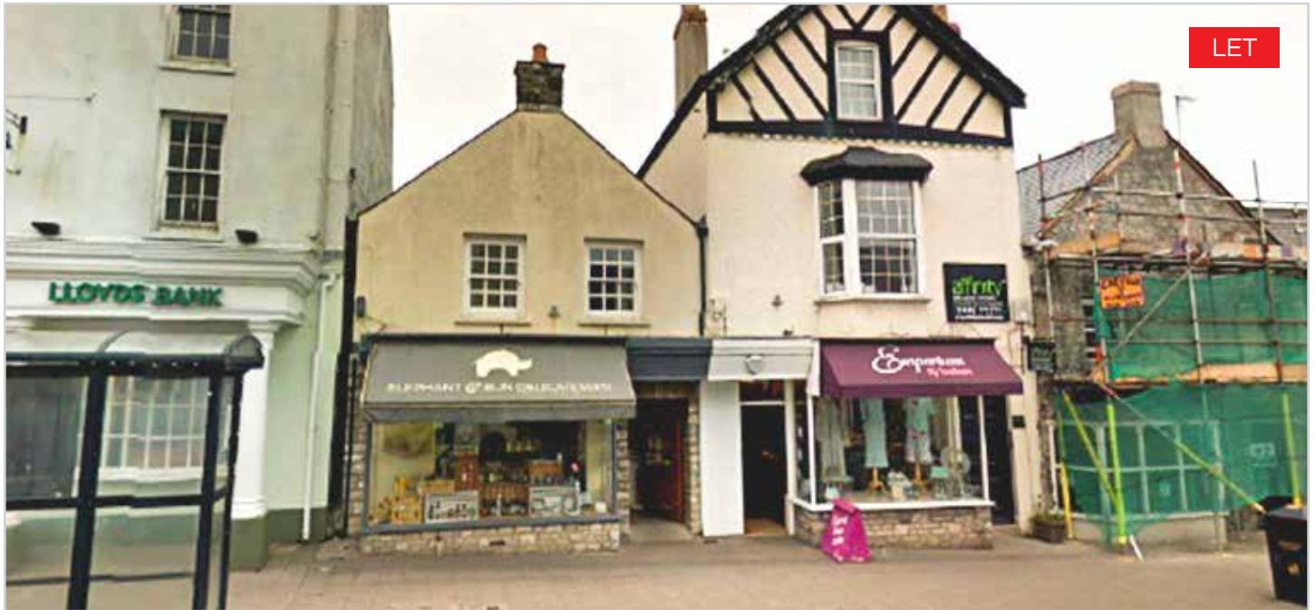
Honeysuckle Cottage, Cowbridge | £625 pcm